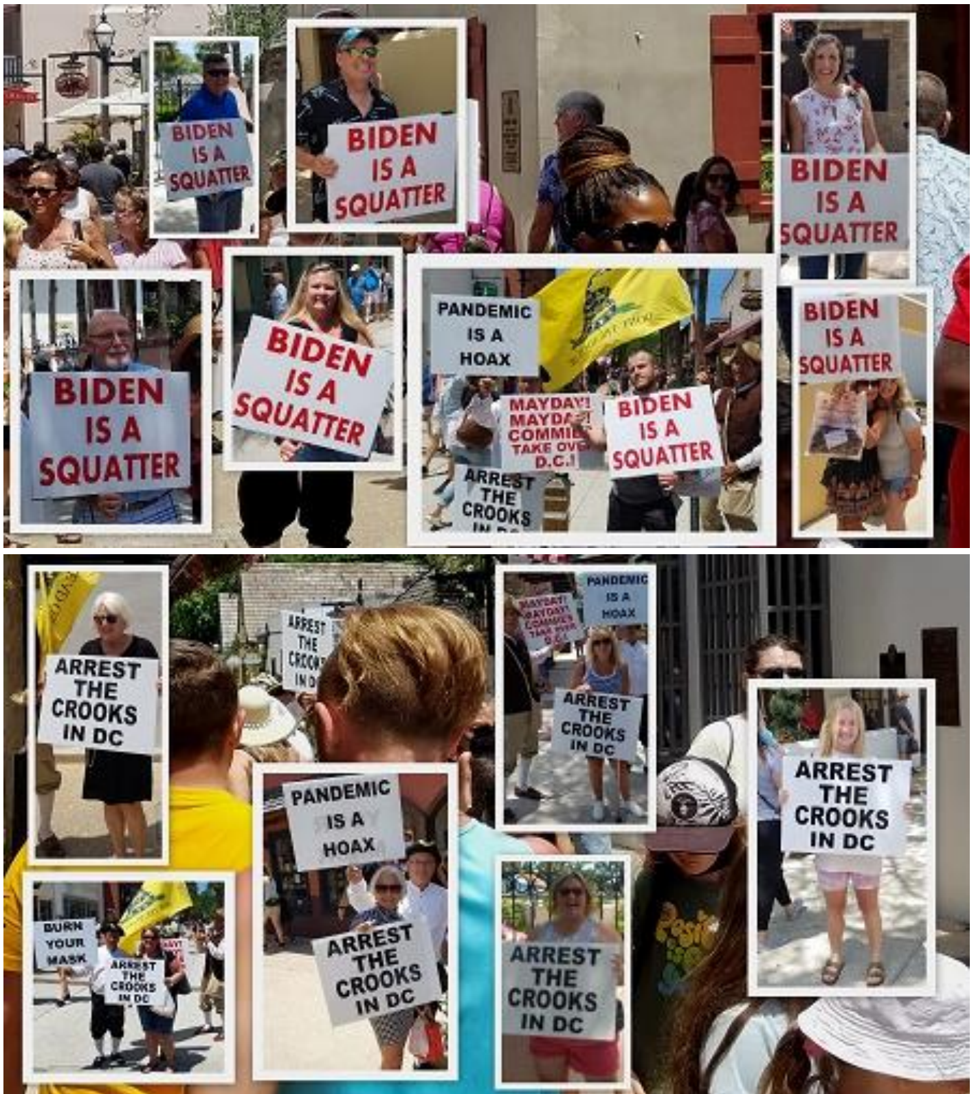
TCCR Staff Photos