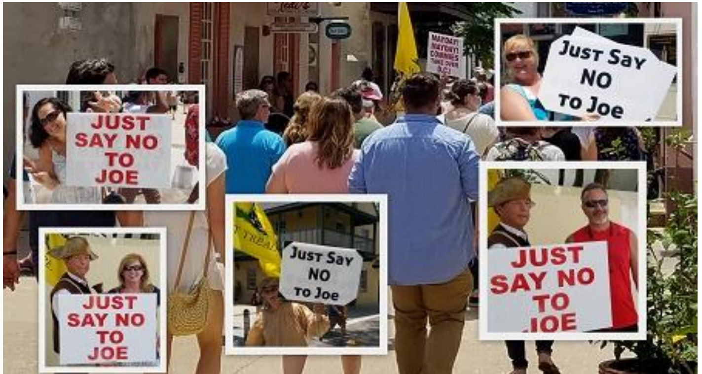
TCCR Staff Photos

When the Communists demonstrate, a hallmark of their protests is chanting which attracts no one and is designed to shut down free speech and intimidate the majority with a noisy minority presence. The Town Criers never use chanting. However, in a middle-class, 'We the People' environment, it is relatively easy to encourage the public to chant. The most popular chant, for example, is "USA, USA, USA..."