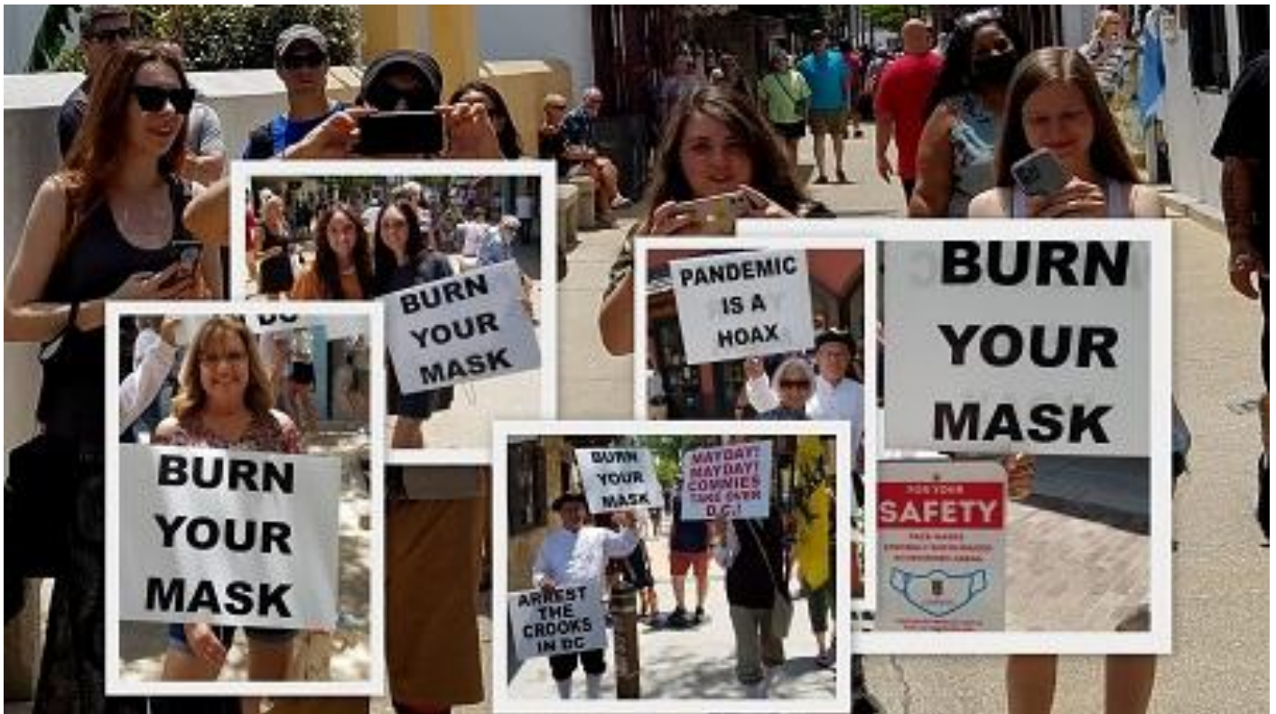
TCCR Staff Photos

Throughout the month of April, the Town Criers have been testing the public's reaction to signs exposing the pandemic as a hoax and testing the public's resolve to continue to conform to mask wearing. [See TCCR V10 N7 http://saintaugustineteparty.org/pdf/Town%20Crier%20Committee%20Vol%2010%20No%2007.pdf Ed]